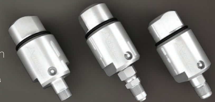
SG-P12P12-62 SG-MP12AV12 SG-CCN MP12K

SG Swivels are reliable, easy to maintain, and are widely used in our surface preparation tools. Heavy-duty ball bearings with external grease fittings, stainless steel construction, and long lasting high pressure seals combine to make these the best swivels in the industry.